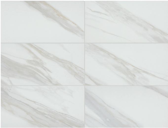
TIMELESS MARBLE CS81