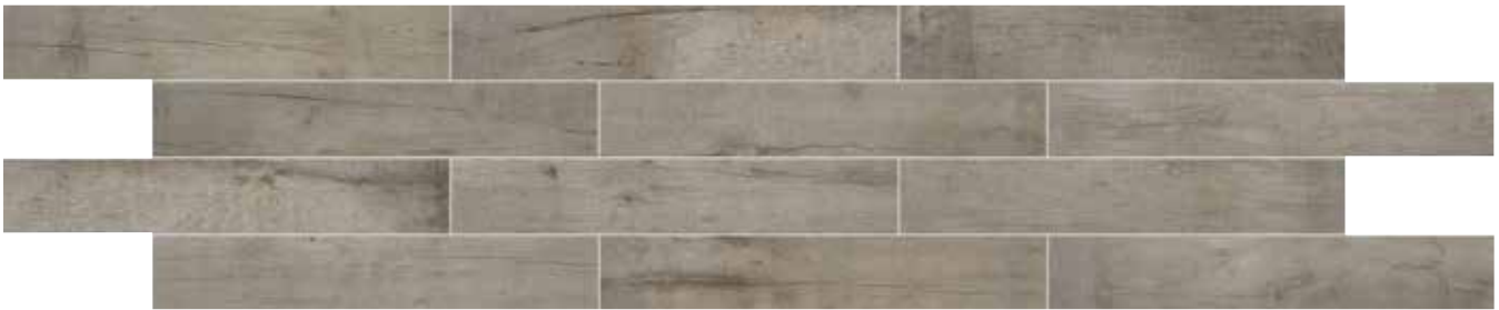
BANK'S BRIDGE HB03