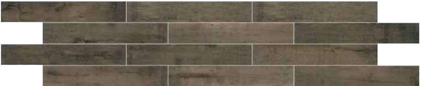
OLD HOLLOW HB02