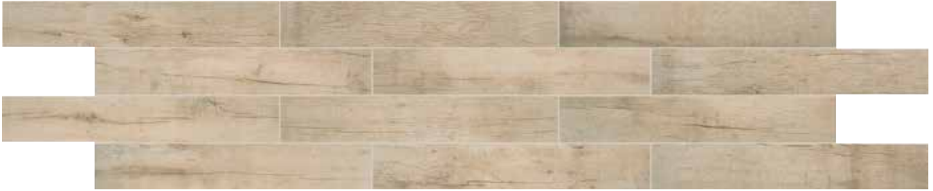
UPPER FERRY HB01