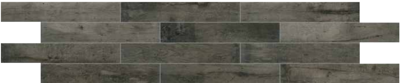
OLD FORGE HB04